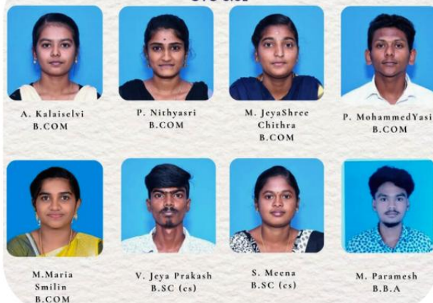
STUDENTS PLACED IN LITERACT FINTECH, COIMBATORE. CTC 3.6L